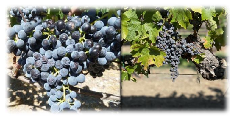
Figure 3. The effect of water stress on the cluster.