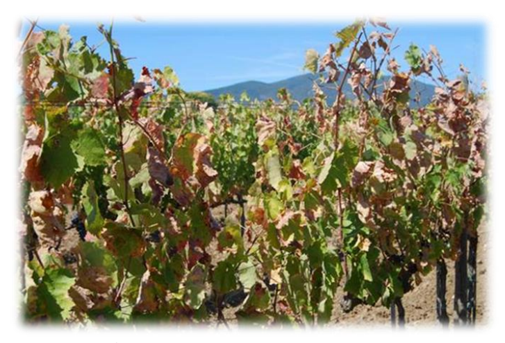
Fig.4. Signs of water stress on vine growth.