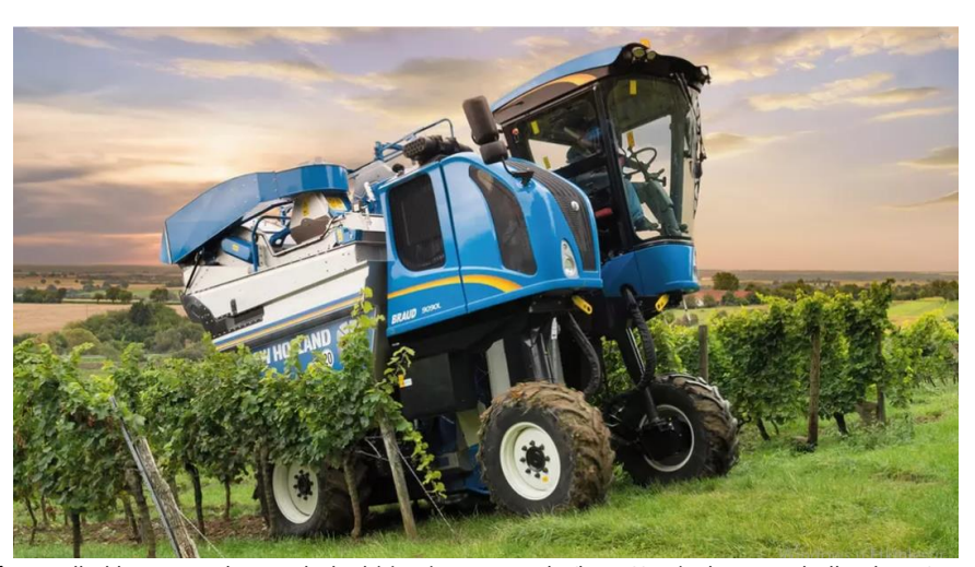
Figure 3. A self-propelled harvester that works by biting into an apple (http://agriculture.newholland.com)

The concept of precision agriculture, as a general approach, can be defined as giving the inputs needed by the plant in agricultural production at the lowest level and in the most effective way by making use of technological opportunities. With this type of agriculture, it is