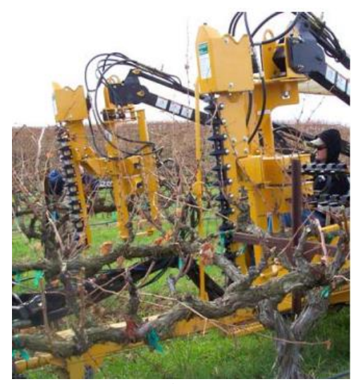
Figure 2. An example of a pruning machine