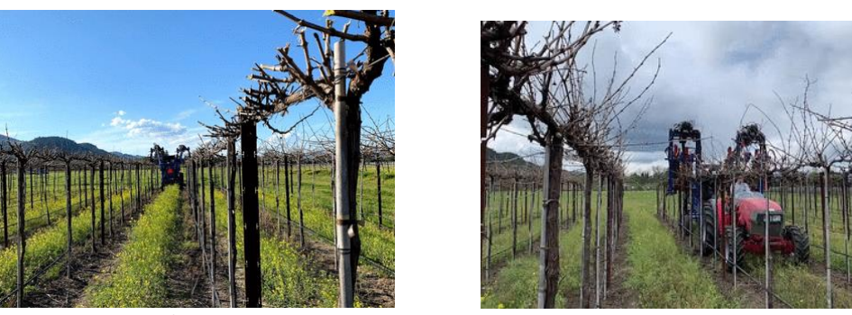
Figure 1. Examples of pruning machines A. Box pruning B. Pre-pruning

A pruner is shown in action at the vineyard at French Camp Vineyards, Santa Margarita, California (Figure 2). This configuration allows the tractor towed unit to trim the facing edges of adjacent rows (Morris,2008).